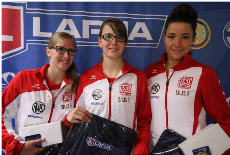
Swiss Quality in Rifle 300m 3 positions , Women